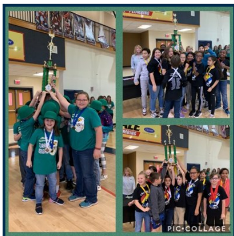
Elementary Science Olympiad