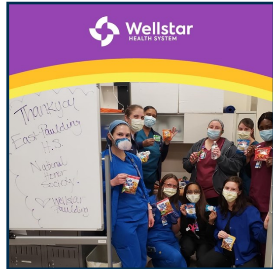
EPHS National Honor Society snack bags for WellStar Paulding Hospital