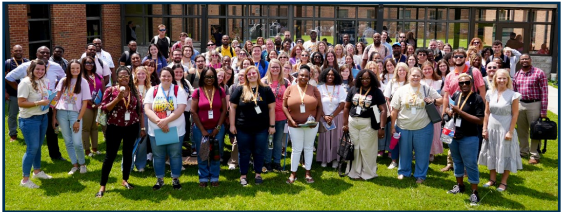
New Teacher Orientation