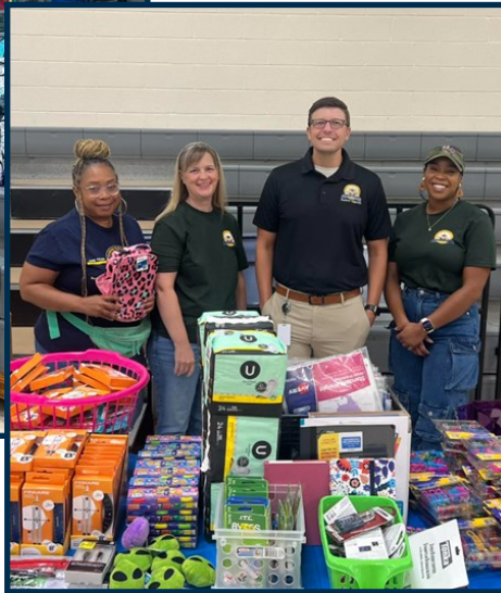
Summer Backpack Program