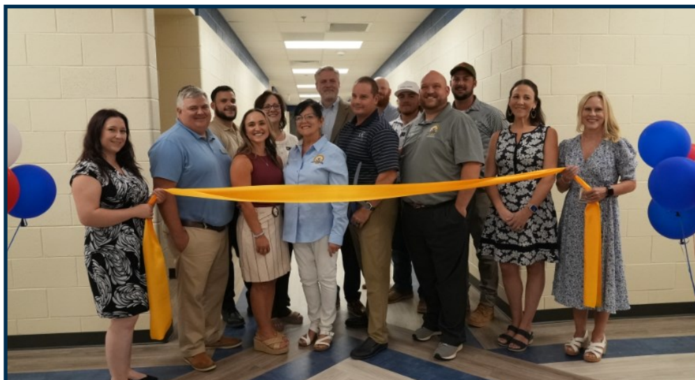
Roberts ES Ribbon Cutting