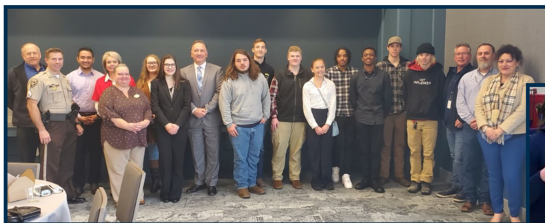
Job Shadow Day hosted by the Chamber of Commerce