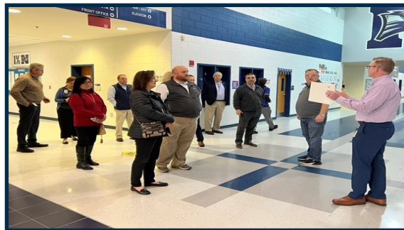
North Paulding High