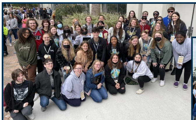
2022 Beta Convention