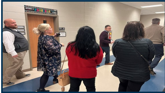
Burnt Hickory Elementary