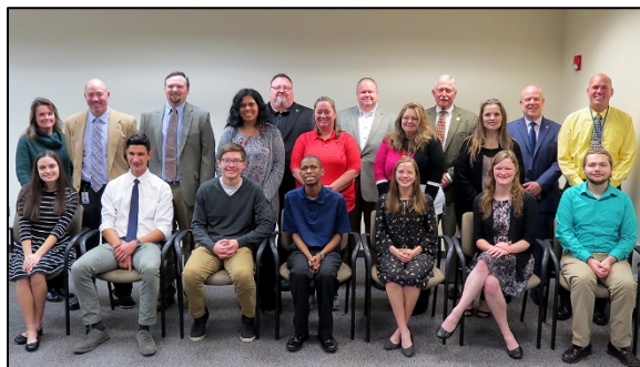
2019 STAR Students

I want to congratulate the Class of 2019 and wish them great success in their future endeavors, and I hope that all of you have a great summer and get to enjoy some well-deserved time off. See you in August!