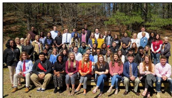
2019 IMPACT Students