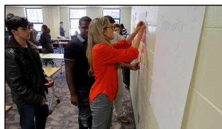
Inclusion & Diversity Training

As our district continues to grow, topping 30,000 students for the first time this school year to rank 12 th in size among all Georgia K-12 school systems, we are welcoming the demographic and cultural changes that have emerged as our district evolves. Recognizing this trend, the district is proactively providing culturally responsive guidance to our administrators, teachers, and students. We want all members of our PCSD community to experience a positive, equitable and supportive learning environment. We will continue to provide guidance that encourages an inclusive approach to meeting the needs of our diverse population of students and families. To date, our Inclusion and Diversity Training program has reached district administrators, principals, school leaders, teachers, students and stakeholders, with a goal to eventually include our entire school community.