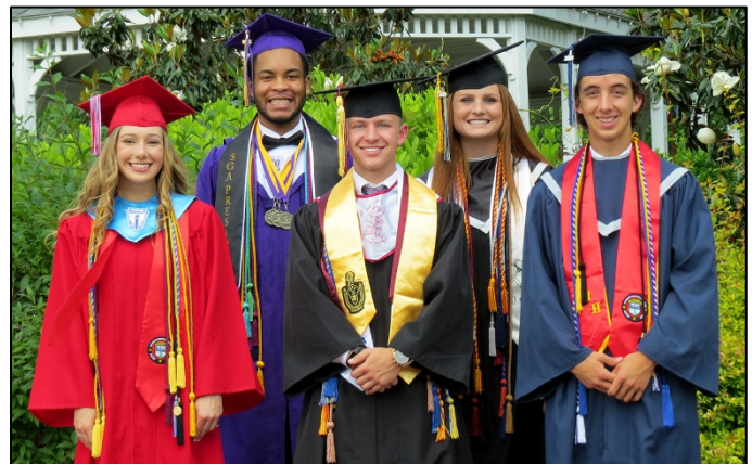
Class of 2019

In the Paulding County School District our vision is to Engage, Inspire and Prepare all students, and we believe that when students are engaged, inspired and prepared, they are more likely to attain success not just today, but for the rest of their lives. We've been fortunate to see students at all grade levels preparing for success throughout this school year.