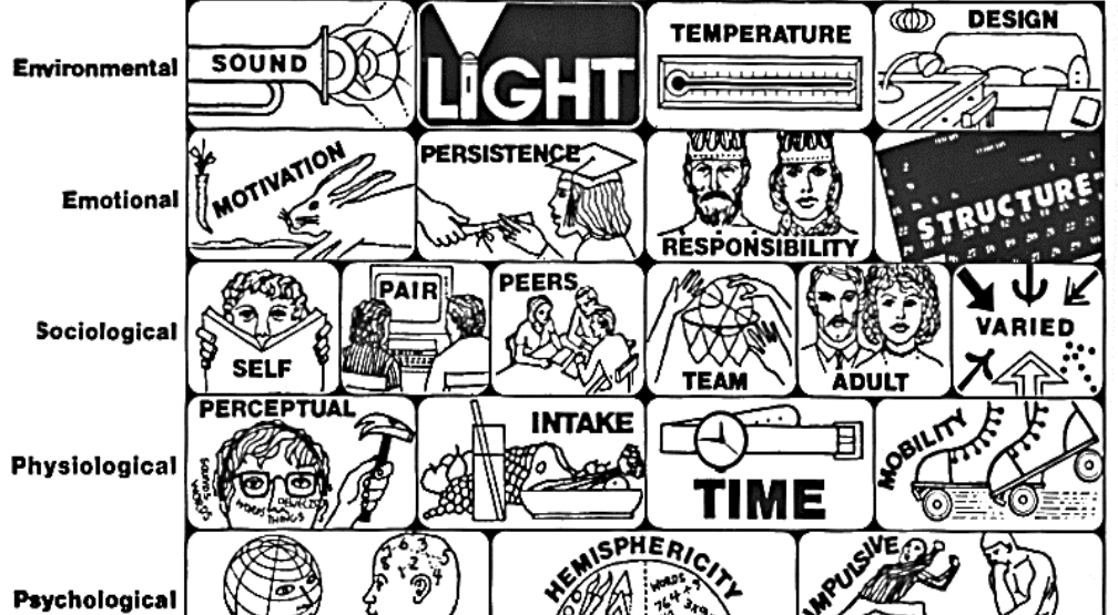
Figure 1. The Dunn and Dunn Learning-Style Model

furniture or seating Design. The Emotional strand focuses on students' levels Motivation. Persistence. Responsibility, and need Structure. for The Sociological strand addresses students' preferences for Learning Alone, in Pairs, with Peers, as part of a Team, with either Authoritative or Collegial instructors, or in Varied approaches as opposed to in patterns. The Physiological strand Perceptual examines